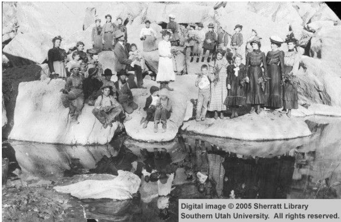
FIGURE 4: SPRINGDALE SCHOOL OUTING TO WEEPING ROCK, 1908.