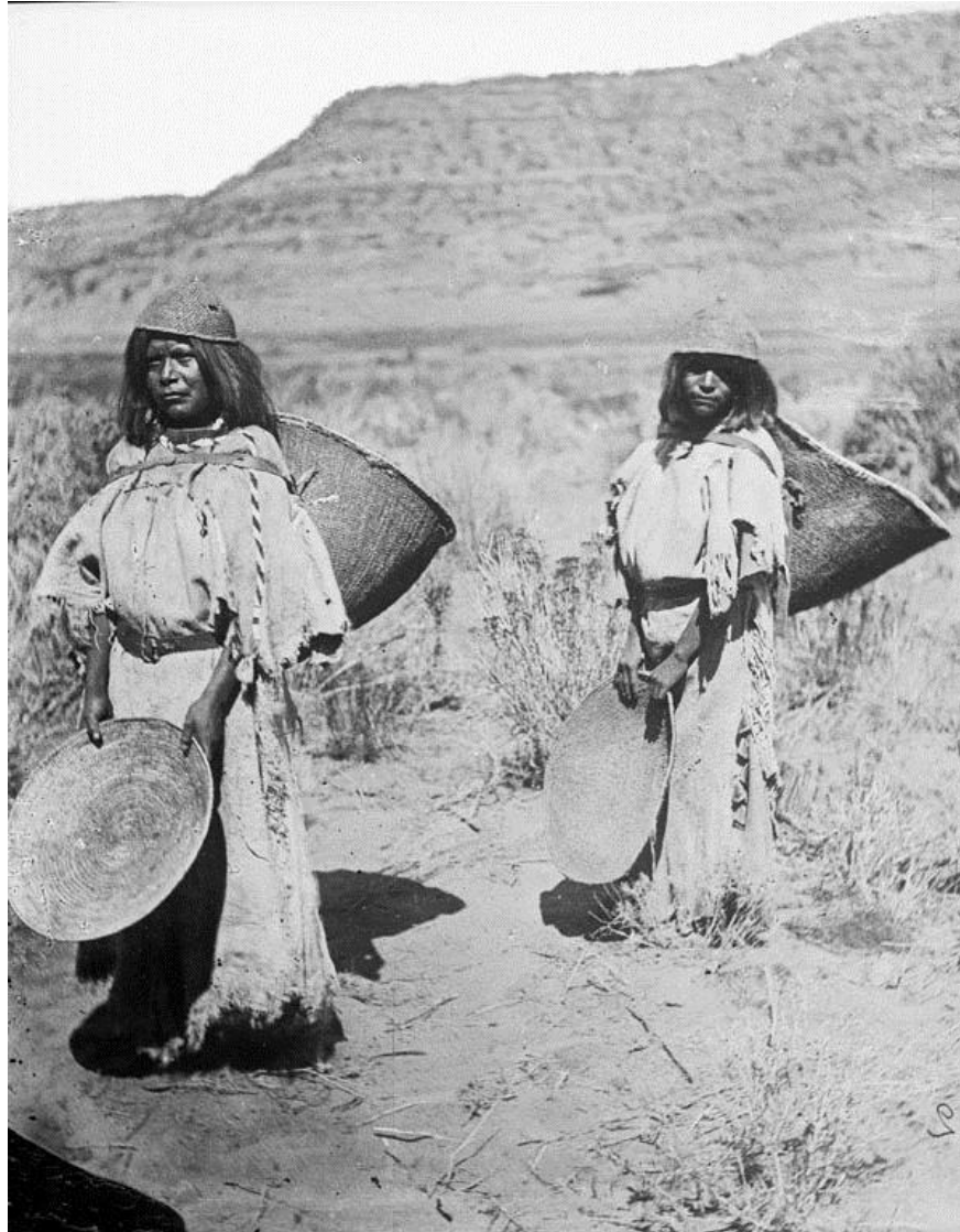
FIGURE 1: KAIBAB PAIUTE WOMEN GATHERING SEEDS. Photograph by J.K Hillers, 1873. Courtesy of Smithsonian Institution, National Anthropological Archives, bureau of American Ethnology Collection. Dresses are actually Northern Ute brought by the photographer and John Wesley Powell. Paiute women normally only wore bark skirts. Basketry is accurate.

The Southern Paiutes' traditional homelands are central to their belief system and identity as a people. Paiutes identify their territories as the place of their creation. According to their origin stories, the world began as a vast ocean from which Ocean Woman created dry land.