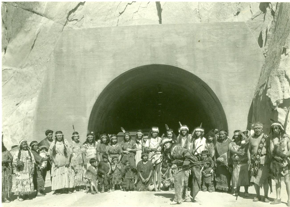
FIGURE 6: NATIVE AMERICAN DANCERS AT THE OPENING CEREMONY OF THE ZION-MT. CARMEL TUNNEL, JULY 4 TH , 1930.

represent its “primitive past” which was popular at the time and regularly done at the Grand Canyon, Yosemite, and Glacier during the 1910s and 1920s. 161 At Zion, Native people were only used in such a capacity a couple of times during this period: for the 1925 grand opening of the newly built lodge up canyon and for the grand opening of the tunnel in 1930. 162 The main reason for this lay with the how the National Park Service, the railroad, and others marketed Zion to the public. In the articles and pamphlets published between 1917 and 1925 on Zion, all described the new park as a religious space whose majesty and wonder inspired tourists and Mormon settlers alike but terrified all Native people. This myth born from misinformation, confusion, and ignorance came to pervade Paiute history in the canyon and remains a dominant narrative to this day.