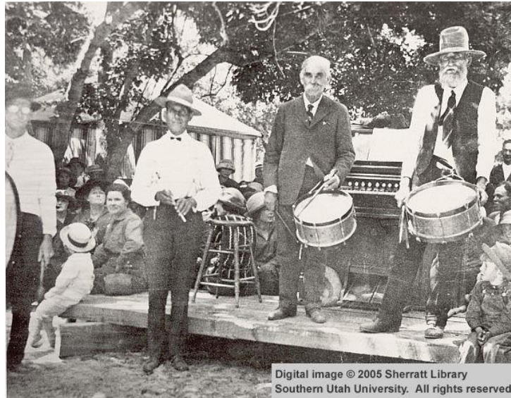
FIGURE 5: SPRINGDALE-ROCKVILLE BAND WELCOMING PRESIDENT WARREN G. HARDING DURING HIS VISIT TO ZION CANYON IN 1923.

At the beginning of the twentieth century, Zion Canyon and the whole Upper Virgin River area were completely a Mormon place in thought, memory, and largely physicality. The Paiutes, who had interacted and utilized this region, had been relocated to reservations where they generally remained. A few, however, continued to use the canyon to gather plants and hunt wildlife as they had done traditionally for centuries. Mormons dominated the region and utilized Zion largely for livestock grazing and planting crops, although they did enjoy some social and cultural activities in the canyon as well. Overall, Zion existed as an extension of the community in Springdale and was a place fully incorporated both economically and culturally. After 1900, descriptions of picnics, hikes, and school fieldtrips in Zion Canyon increased. This demonstrated the general economic success they managed to achieve, the fondness the people had developed for the canyon, as well as the national and regional influences regarding outdoor recreation as a